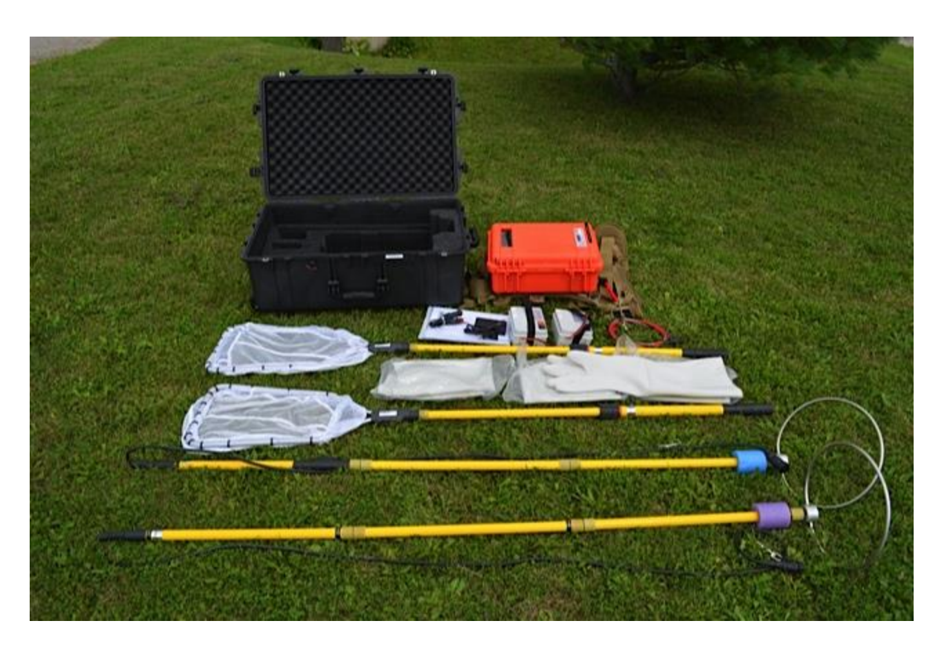
All of these items can fit into our Rugged Transport Case on Wheels