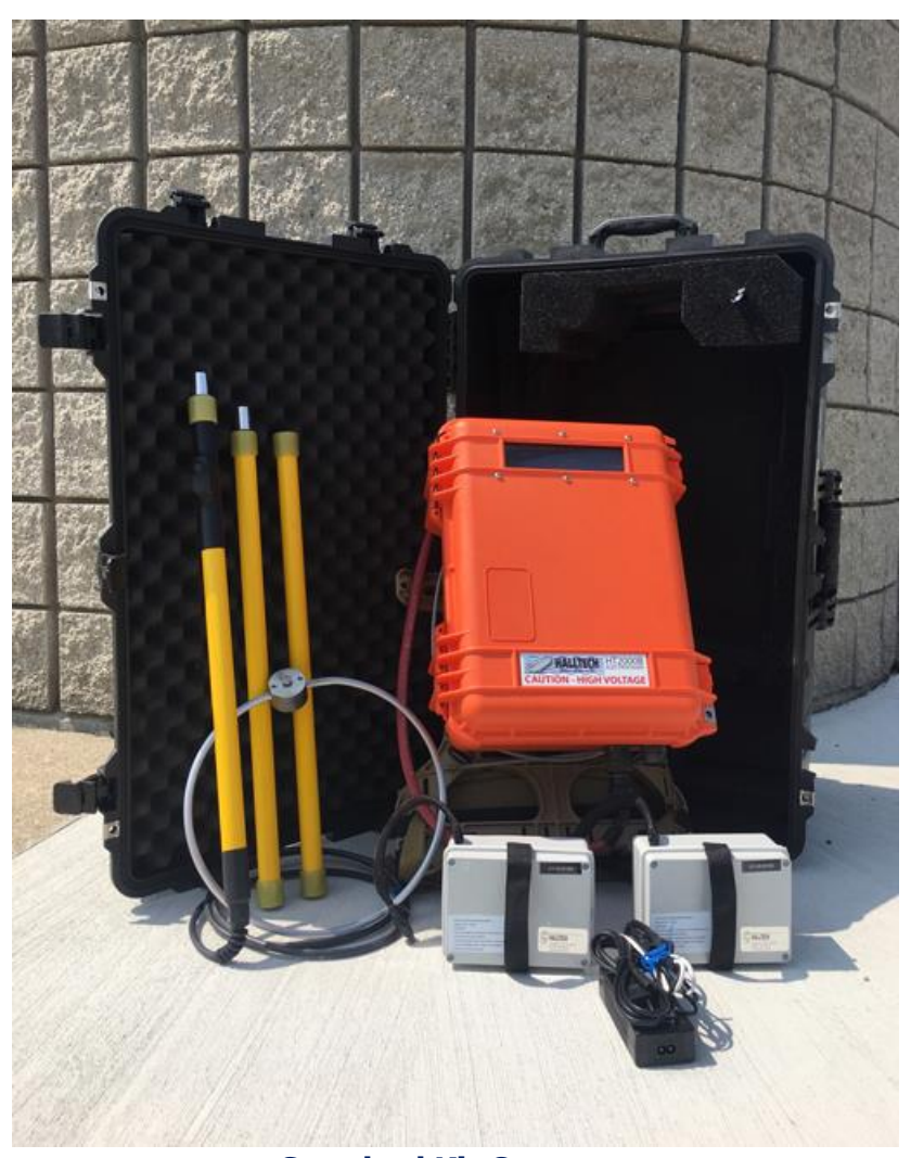
Standard Kit Contents

Please do not hesitate to contact us with any question or if you would like to proceed with an order.